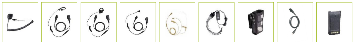
Remote Speaker Microphone (IP57) SM18N2 C-Earset EHN16 Swivel Earset EHN17 Earbud ESN12 3-Wire Surveillance Earpiece with Transparent Acoustic Tube (beige) EAN17 Six-Unit Switching Power PS7002 Carrying Case (for thick battery) (leather) (swivel) LCY003 Programming Cable (USB Port) PC38 2500mAh Li-Ion Battery BL2503