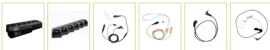
Battery Optimizing System MCA05 MCU Multi-unit Charger (for Thick Battery) MCA08 3-wire Surveillance Earpiece with Transparent Acoustic Tube (Black) EAN18 2-wire Earpiece with Neck Loop (Beige) EWN06 Receive-only Earpiece ESS07 Receive-only Earpiece ESS08

Pictures above are for reference only and may vary from actual products.